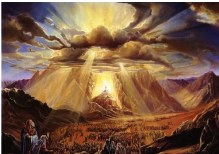
Mt Sinai

Exodus 31:18 When He had finished speaking with him upon Mount Sinai, He gave Moses the two tablets of the testimony, tablets of stone, written by the finger of God.